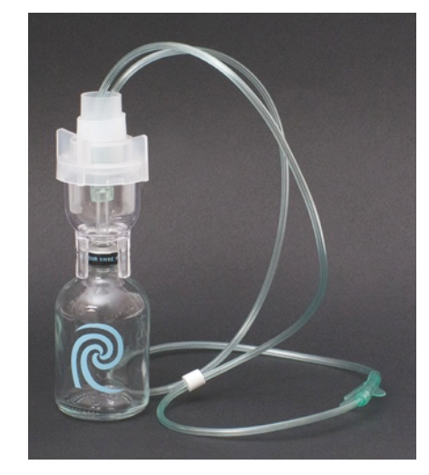
Beach Packaging Design, Respirer, 2012