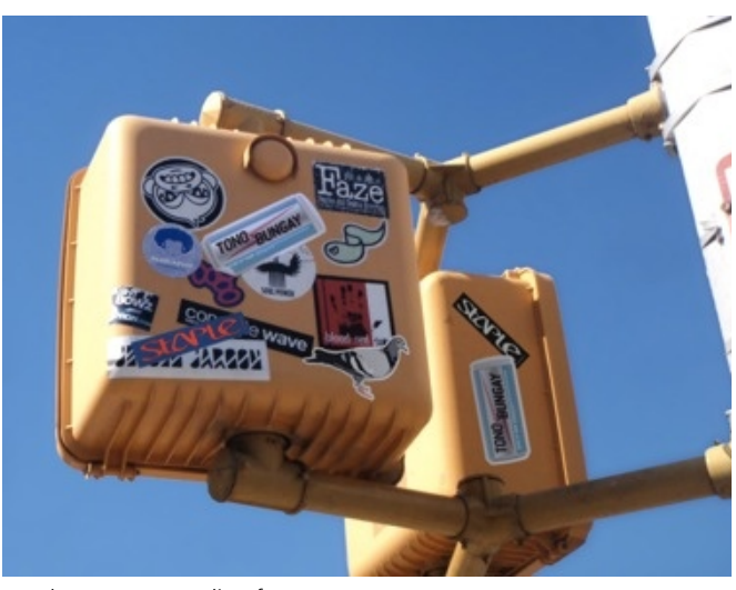
Staple Design, Branding for Tono-Bungay, 2012

This can be hard to accept, because in the smug 21st Century, we regard ourselves as possessed of unprecedented consumer savvy. We tell ourselves that gullible past generations were easily manipulated by real-life Don Drapers, but today we see the commercial