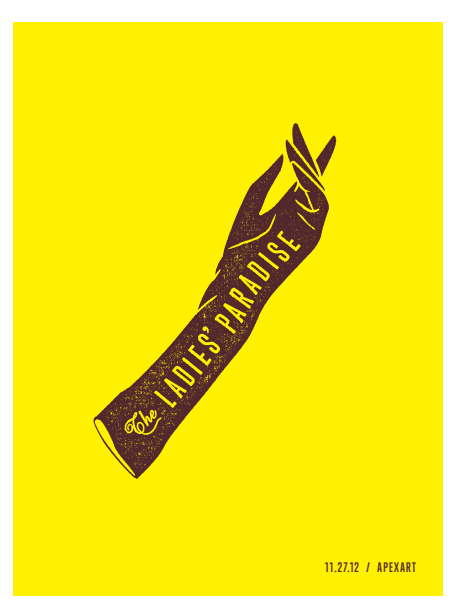
Oliver Munday, Logo for The Ladies' Paradise, 2012

at a time when MakerBot's devices are closing the gap between products and imagination. With these machines, you can manufacture your own dreamed-up goods, marking the latest advance in complicating the matter of what, exactly, counts as a "real" product.