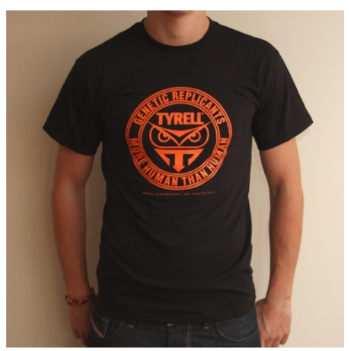
Last Exit to Nowhere, Tyrell Corporation 2019 t-shirt

While imaginary brands have populated fictions for generations, some have the Factory, 2005 lately been "defictionalized," crossing over into the real world — and into this exhibition, since their existence is uncanny enough to consider in this marketplace of ideas. What does it mean to sport a T-shirt, like those from Last Exit To Nowhere, advertising Soylent Green, the Tyrell